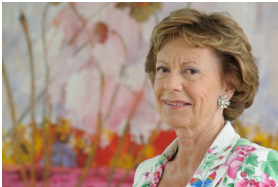
Vice-President Neelie Kroes Digital Agenda Digital single market