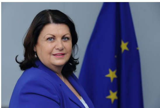
Commissioner Máire Geoghegan-Quinn Research & Innovation Horizon 2020 European Research Area (ERA) & Innovation Union